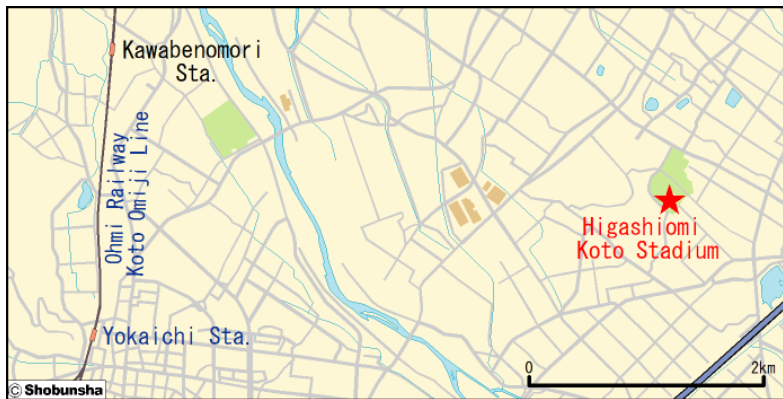
■ Higashiomi Koto Stadium