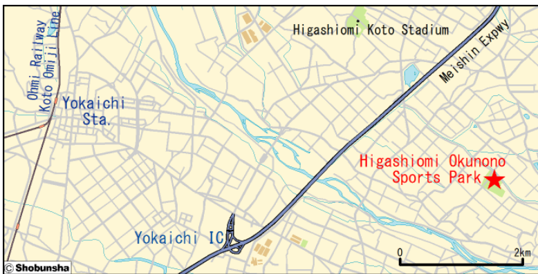
■ Higashiomi Okunono Sports Park